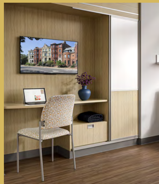
Previous Spread Steelcase Convey Modular Casework Steelcase Surround Sleeper Steelcase Verge Stools Steelcase Empath Recliner