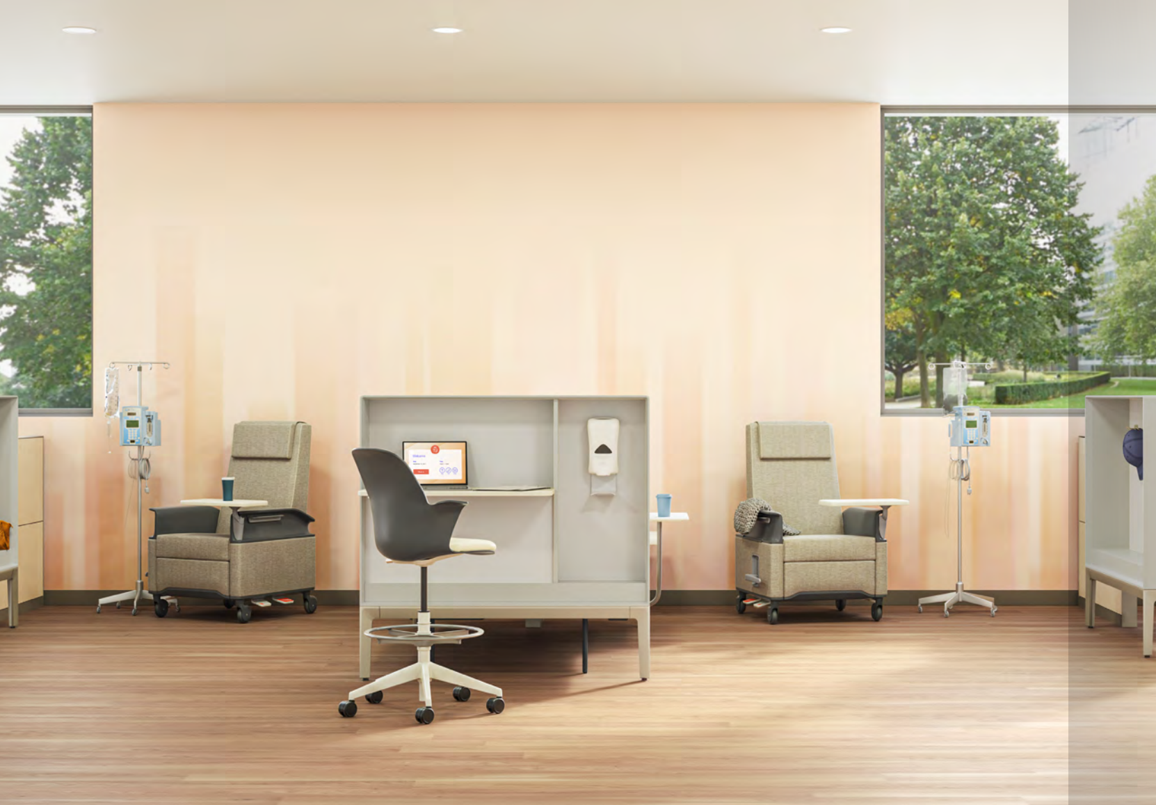
Steelcase Node Stool Steelcase Montage Panel Steelcase Empath Recliner Steelcase Surround Steelcase Regard