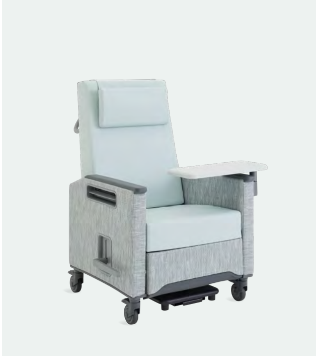
Steelcase Empath Recliner

Steelcase VIA Modular Wall Steelcase Regard Lounge Steelcase Node Chair Steelcase Convey Modular Casework