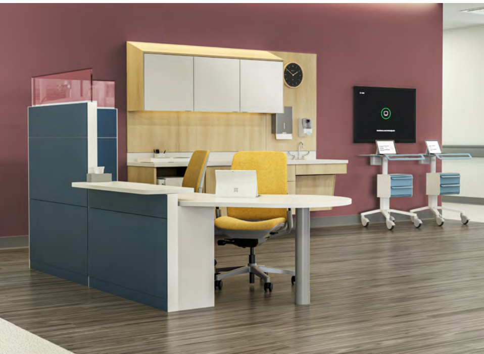
Steelcase Convey Modular Casework Steelcase Montage Panels Steelcase Amia Chair Steelcase Pocket Cart