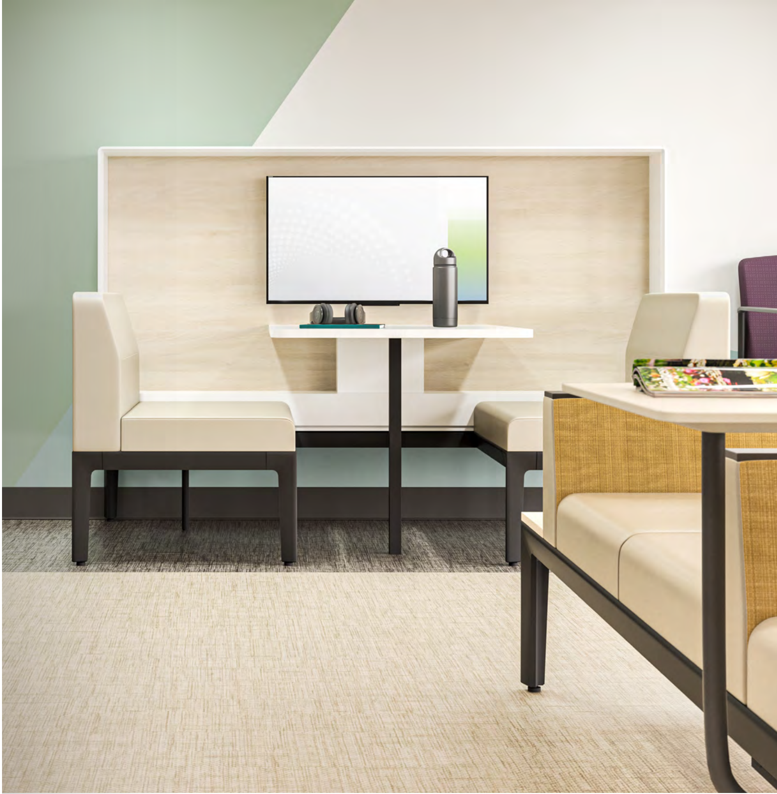
Steelcase Regard Booth