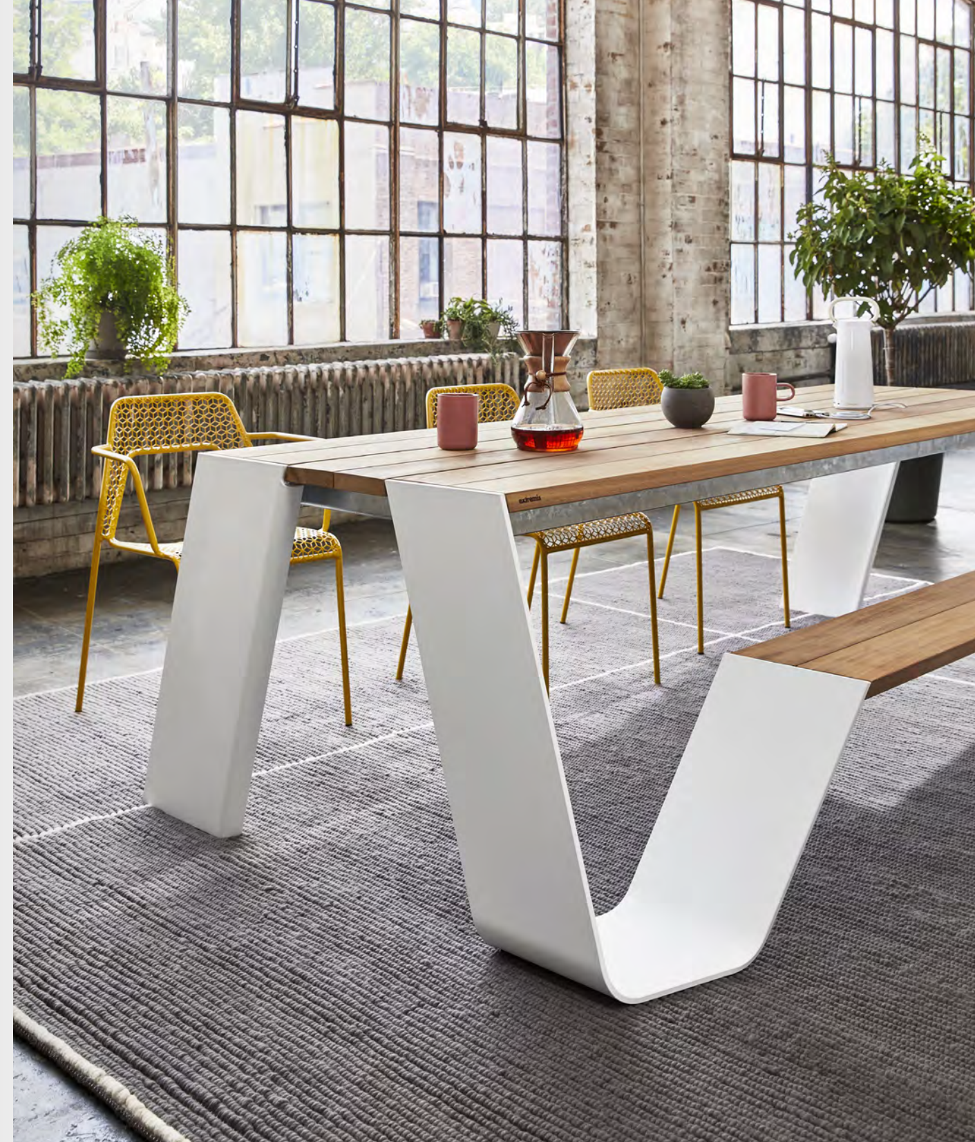
Extremis Hopper Combo Bench Blu Dot Hot Mesh Chair Blu Dot Collet Rug Steelcase Flex Mobile Power

Previous Spread Extremis Gargantua Picnic Table Extremis Inumbra Shade