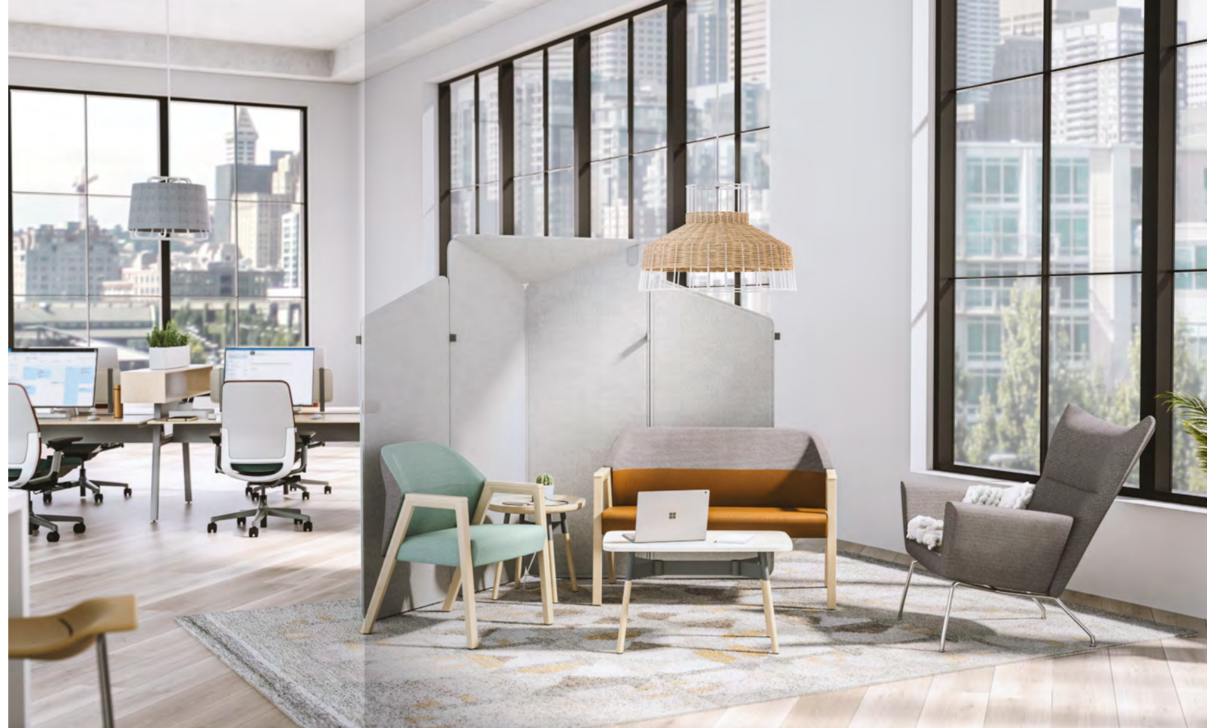
Steelcase Embold Seating and Tables Coalesse Wing Chair CH445 Steelcase Clipper Screen Steelcase Bivi Workbench Steelcase Amia Chair

Workers today need flexible spaces that can change over time — spaces that offer safety, comfort and a sense of belonging.