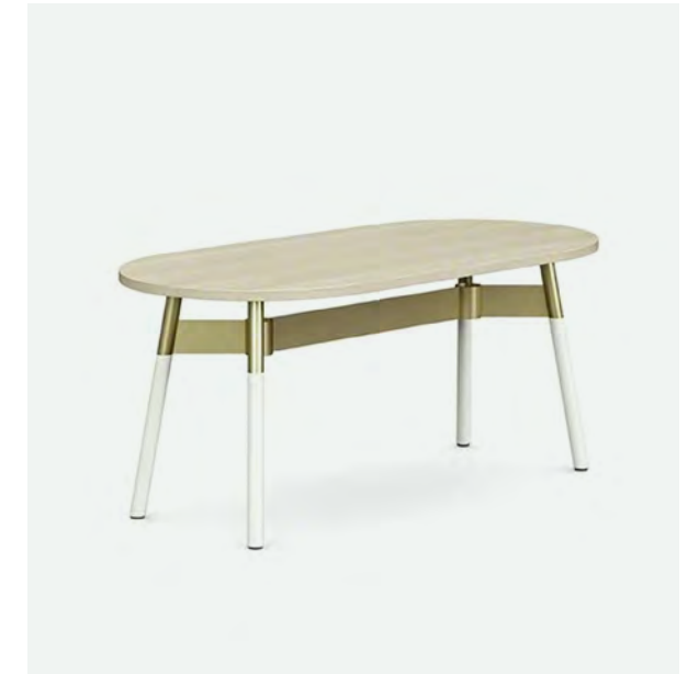
Steelcase Embold Table