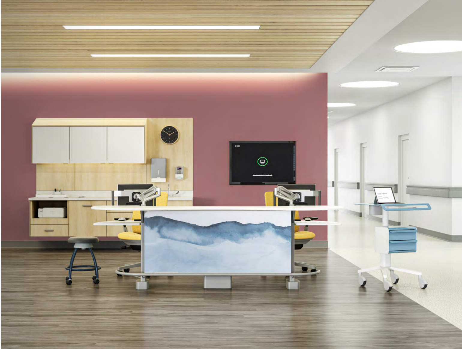
Previous Spread Steelcase Convey Modular Casework Steelcase Series 1 Chair Steelcase Ology Height-Adjustable Desk