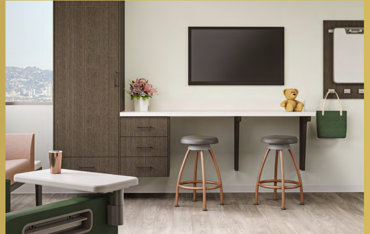
Steelcase Convey Modular Casework Steelcase Verge Stools