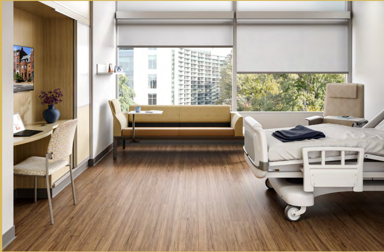
Steelcase Opus Caseworks Steelcase Sorrell Chair Steelcase Surround Sleeper Steelcase Empath Recliner