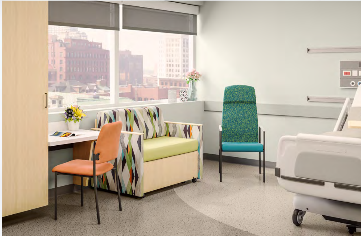
Steelcase Sorrel Chair Steelcase Aspekt Patient Chair Steelcase Xtenz Sleeper