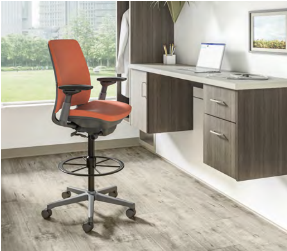
Steelcase Convey Modular Casework Steelcase Gesture Stool