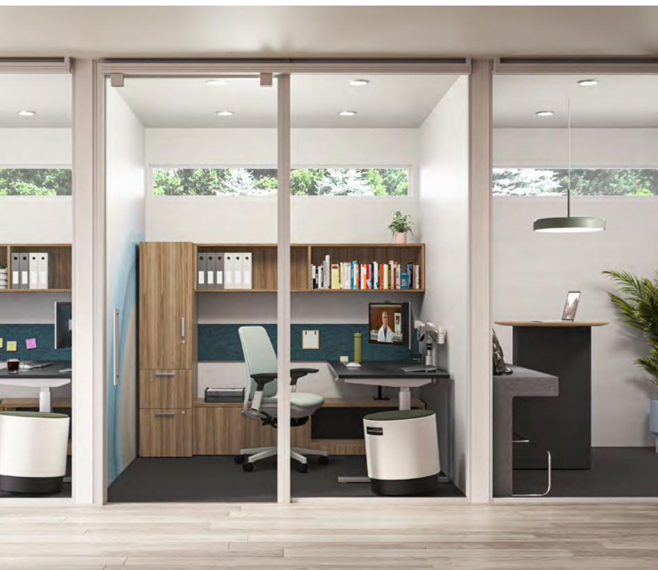
Steelcase Currency Desk System and Storage Steelcase Amia Chair Steelcase Buoy Stool Steelcase Migration SE Height Adjustable Desk Steelcase CF Series Dual Monitor Arm Blu Dot Bobber Pendant, Large Orangebox Border