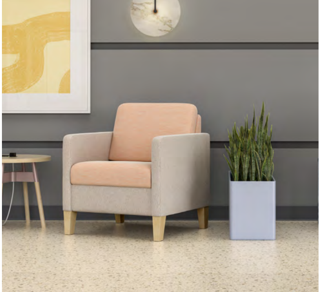
Steelcase Sieste Lounge Steelcase Embold Table Steelcase Regard Planter