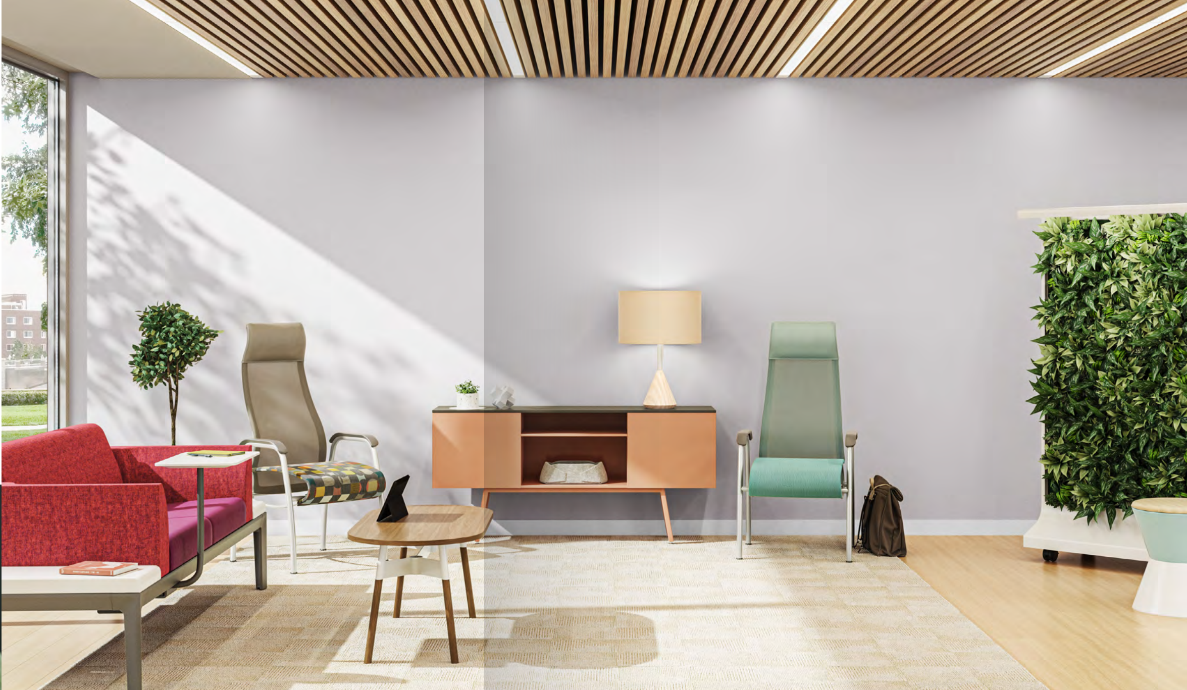
Steelcase Surround Lounge Steelcase Cura Seating Steelcase Bivi Trunk Blu Dot Flask Lamp