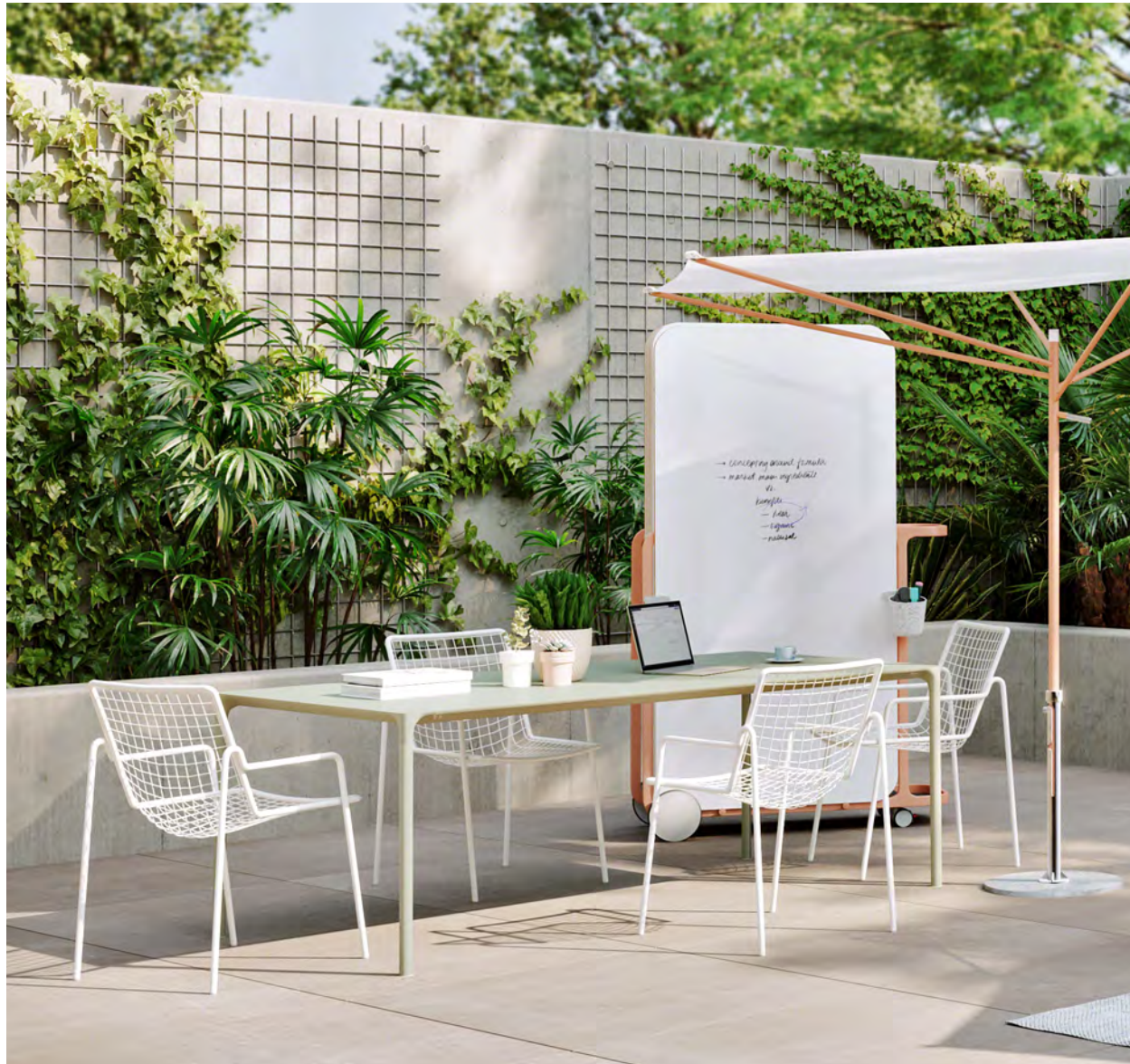
Coalesse Emu Terramare Rectangular Table Coalesse Emu Rio Dining Chairs Steelcase Flex Freestanding Screen

Previous Spread Extremis Gargantua Picnic Table Extremis Inumbra Shade