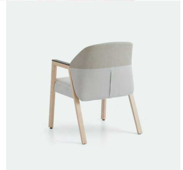
Steelcase Embold Seating