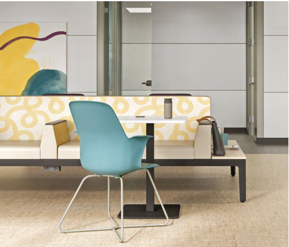
Steelcase VIA Modular Wall Steelcase Node Chair Steelcase Regard Lounge